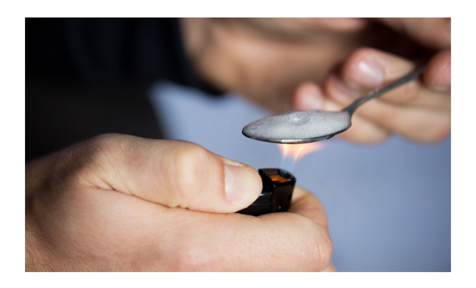
Crack Cocaine Addiction And Its Dangers